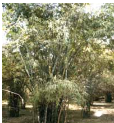
Selected clumps of D. strictus at FRI

Keeping in view the importance of the improved planting material, an inter-institutional project on bamboo improvement was executed by FRI, Dehradun (nodal agency) along with 4 other ICFRE institutes viz. IWST, Bengaluru; TFRI, Jabalpur; RFRI, Jorhat and IFP, Ranchi on ten priority species viz. Dendrocalamus strictus , Bambusa bambos , B. vulgaris , B. tulda , B. nutans , B. balcooa , D. hamiltonii , Pseudoxytenanthera stocksii (syn. Dendrocalamus stocksii ), D. brandisii and D. somdevai . In the first phase the evaluation trials of selected bamboo species established in past were revisited across different locations in the country, and evaluated with a set of selection parameters. Promising superior clumps were identified through multi-trait evaluation. The rhizomes/offsets of the superior clumps were