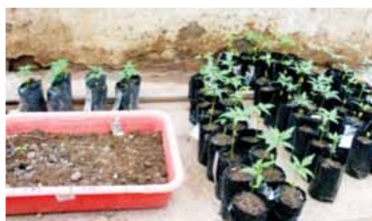
Experimentation on polyploidy

their leaf and roottips were used for chromosomal studies to screen natural polyploidy. The experimentation on analysis of chromosomes among different progenies has also been