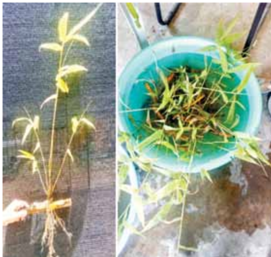
Propagation of improved clumps in mist chamber

In second phase of the project, out of the selected 357 clumps, 177 clumps were taken up for their multiplication based on their previous record of flowering and further screening.