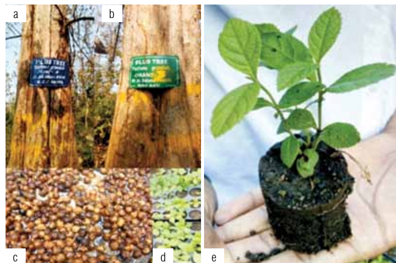
Teak ( Tectona grandis L.f.) CPTs selected from Angul, Odisha (a, b), their seeds (c) and progeny (d, e)

proven genetic worth would be released for commercial plantations as interim measures for amelioration of timber productivity and quality in different agroclimatic zones.