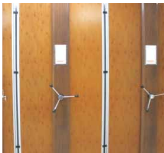
A view of new herbarium hall with state of art compactors after furnish