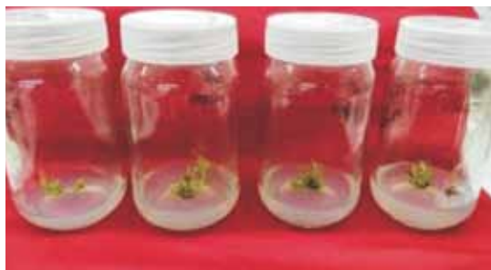
In vitro multiplication of H. salicifolia shoots

It is intended to collect seeds of 90 important FGR species in this project for their storage and conservation. Surveys were conducted for demarcation of populations of important FGR species and availability of their seeds. Seed of more than 18 FGR species collected from different parts of Uttarakhand and their seed handing and viability testing procedure were performed. Seeds have been kept for medium term storage.