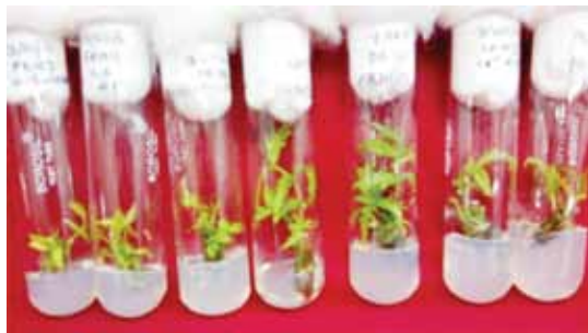
Tissue Culture of Neem

initiated and ample seeds have been germinated under aseptic conditions.