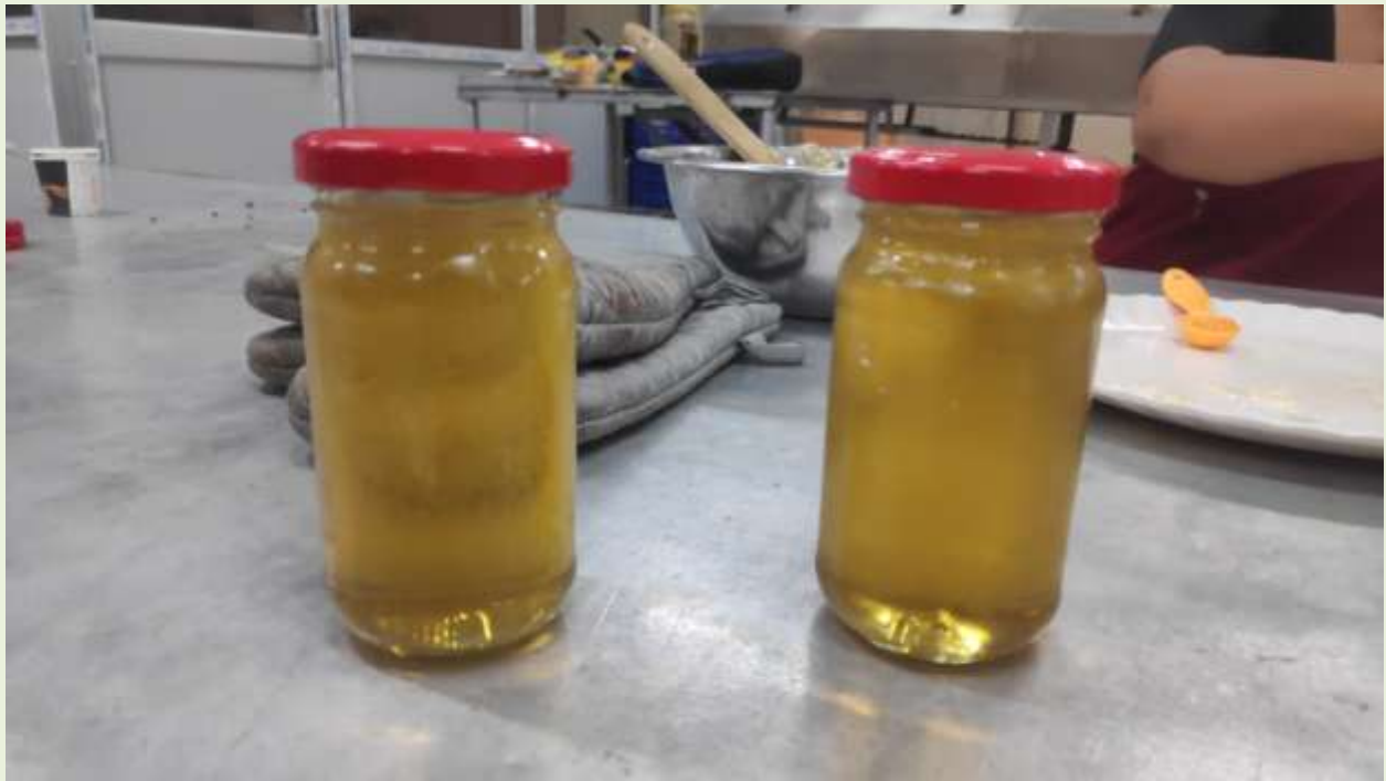
Readied Papaya Jelly