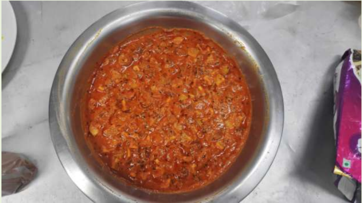
Readied Kiwi pickle