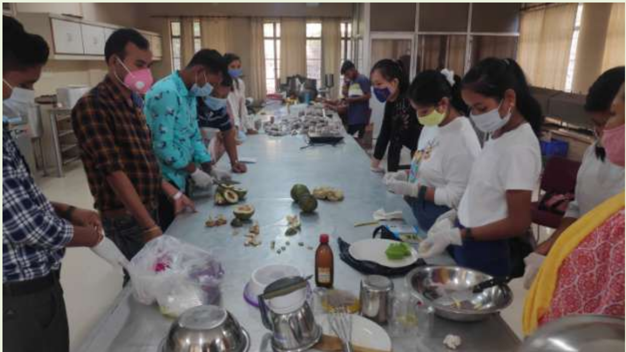
Preparation of raw materials for next recipe