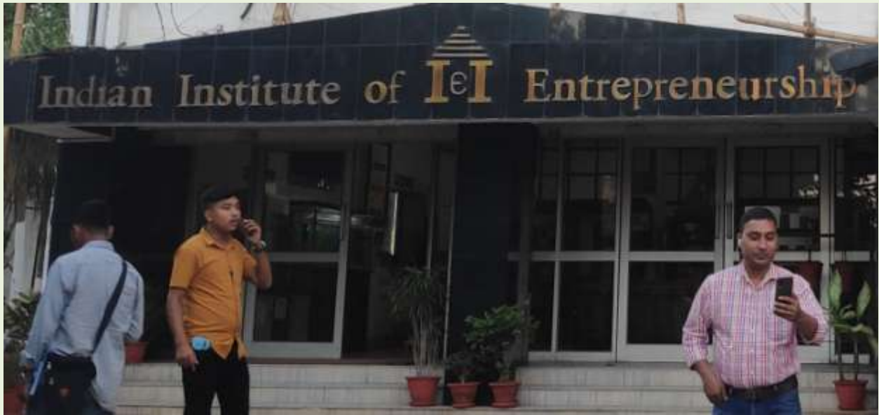
Overview of the Institute