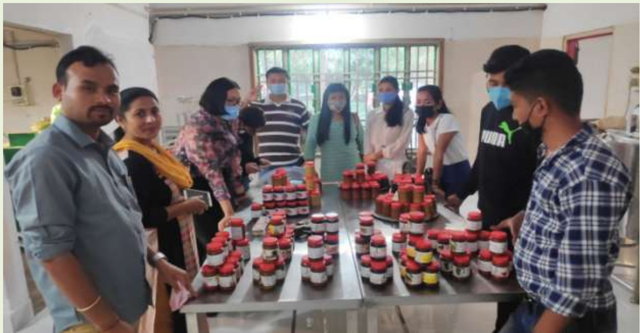
Few products of Kamdhenu Industry