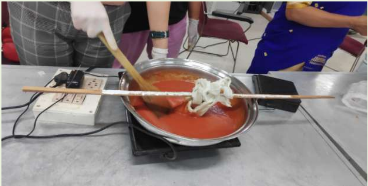
Cooking of Tomato sauce