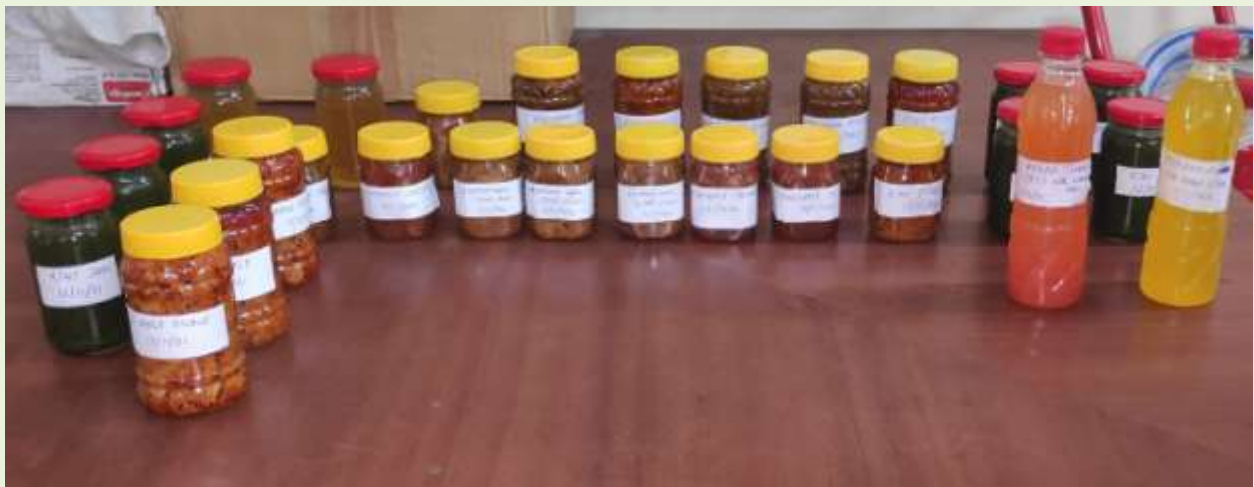
Display of prepared products