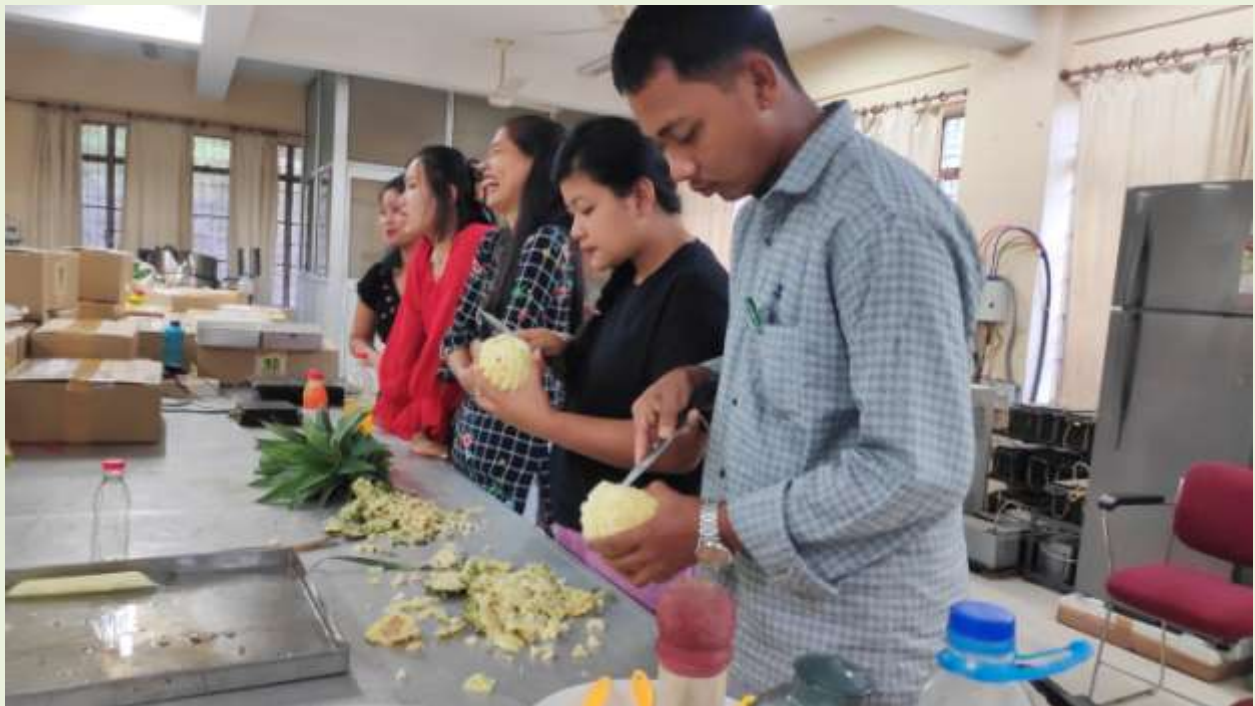
Hands-on training to master cutting skills