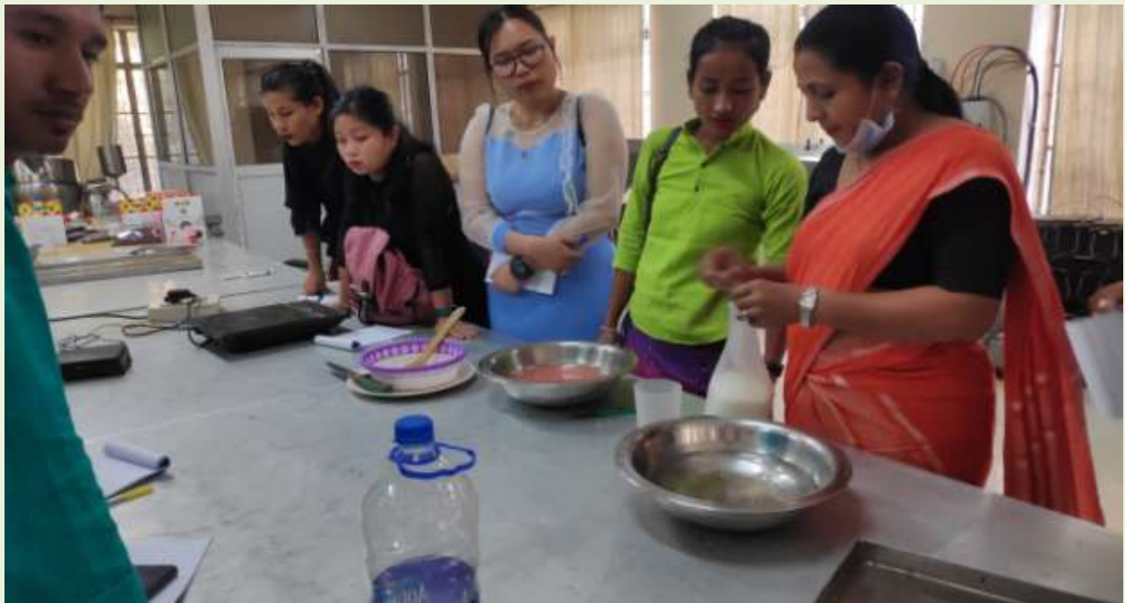
Mixing of other ingredients to the final Ready to Serve(RTS) juice product