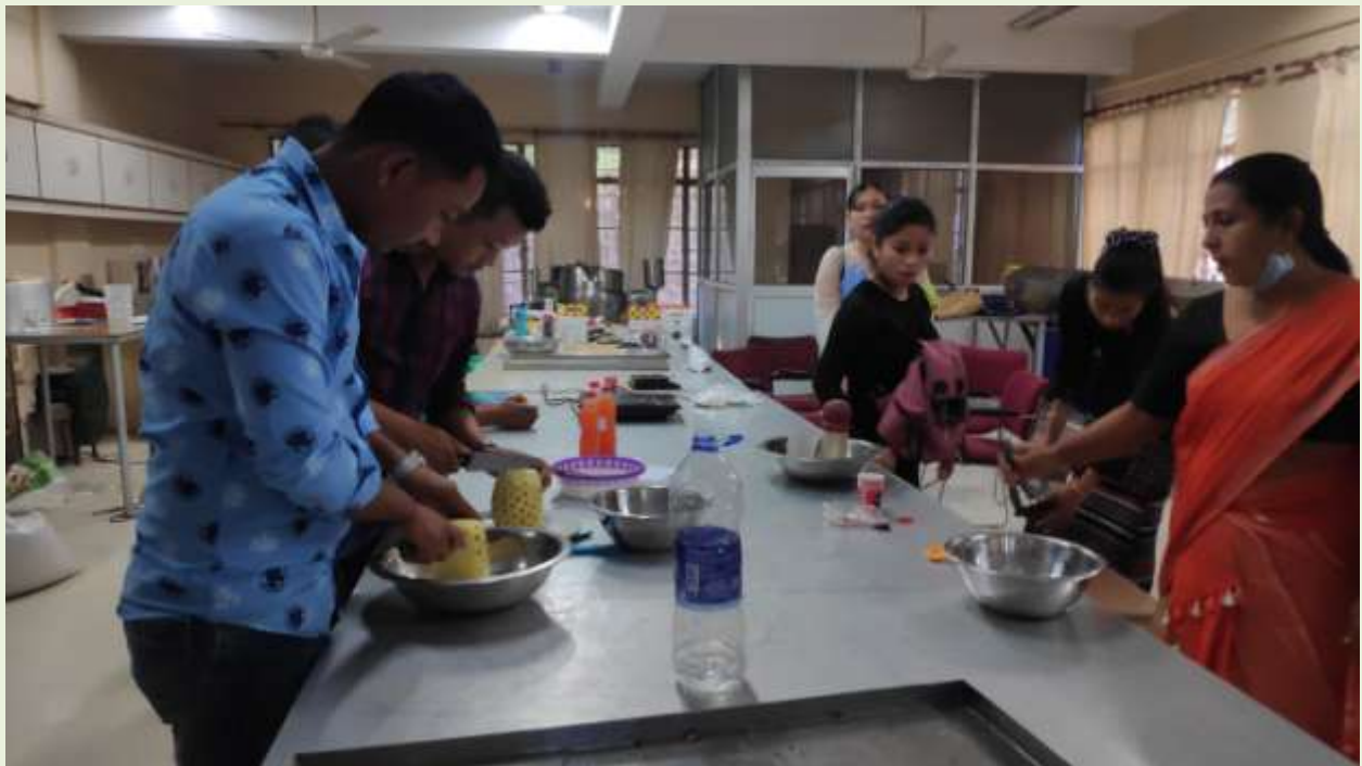
Demonstration of Peeling and cutting techniques