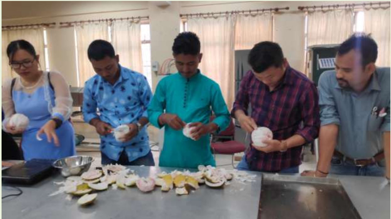
Hands-on training on peeling of Indian Pomelo