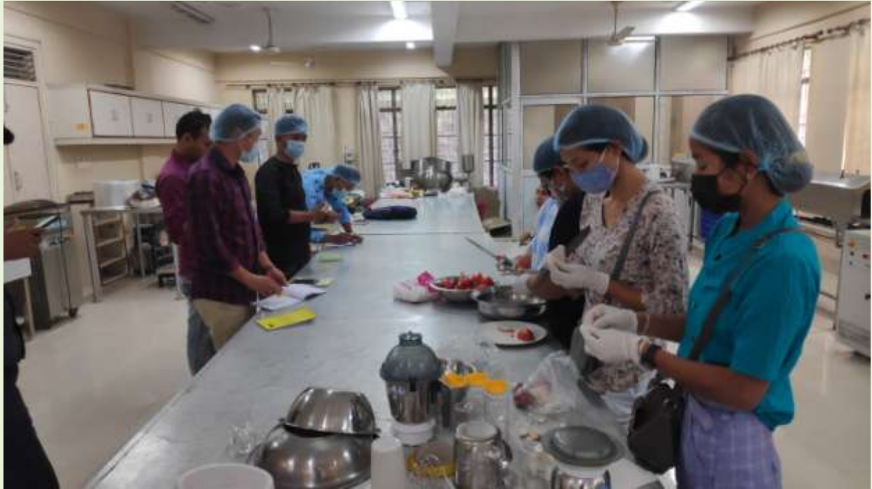
Preparation of Tomato for sauce preparation