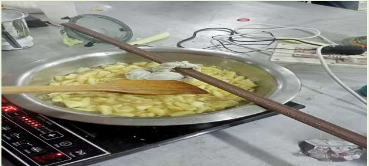
Preparation of Pineapple for pickling by trainee