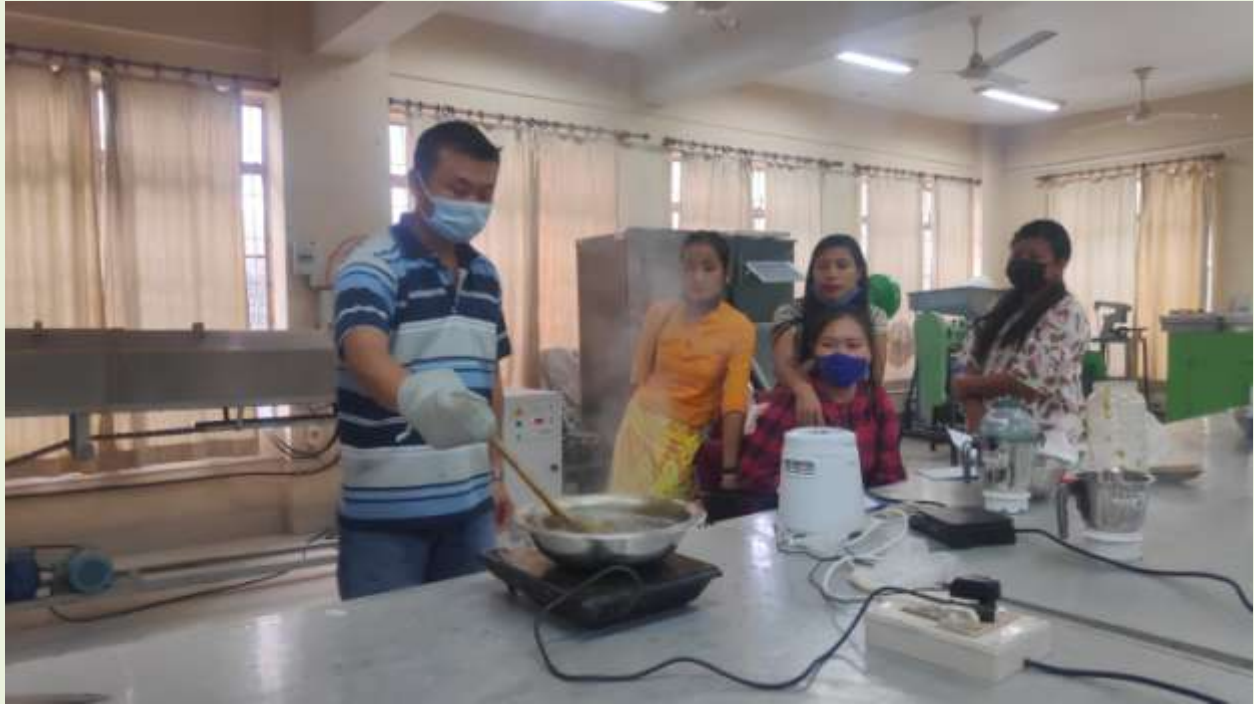
Preparation of Pineapple for pickling