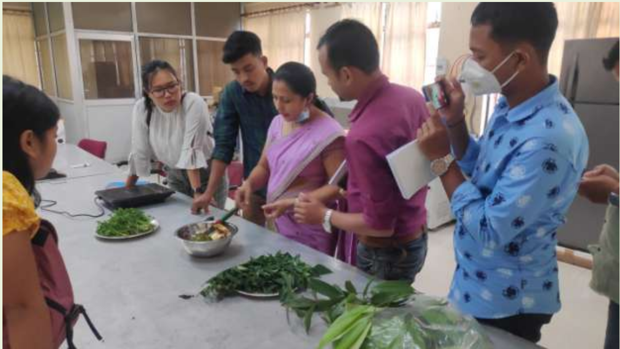
Demonstration of selection of proper spices to be used