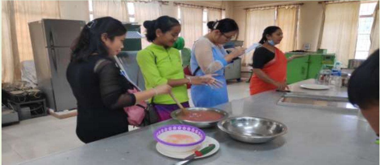
Final RTS juice