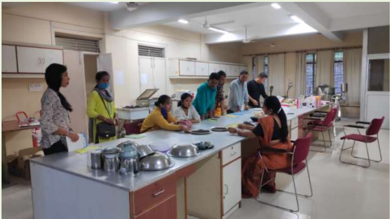
Demonstration of selection of Raw materials