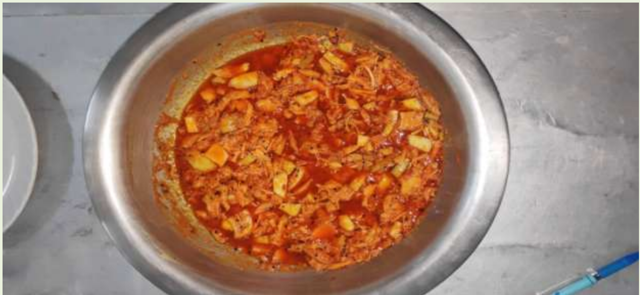
Readied Dillenia Indica pickle