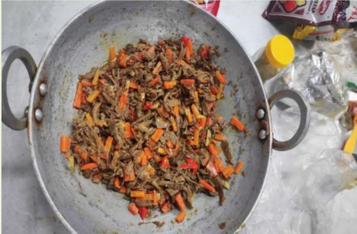
Ready Kiwi pickle