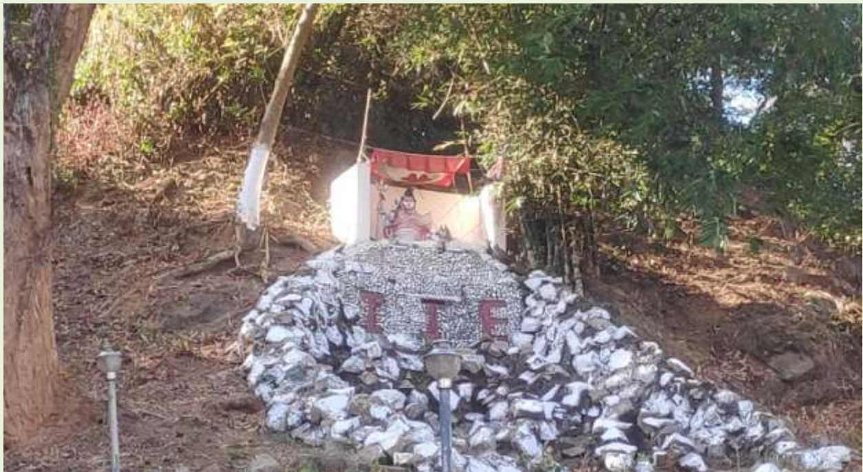
Sculpture at the entrance of IIE