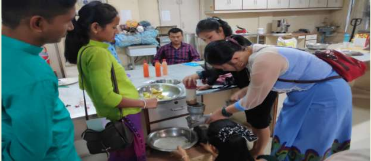
Demonstration of correct use of pulper