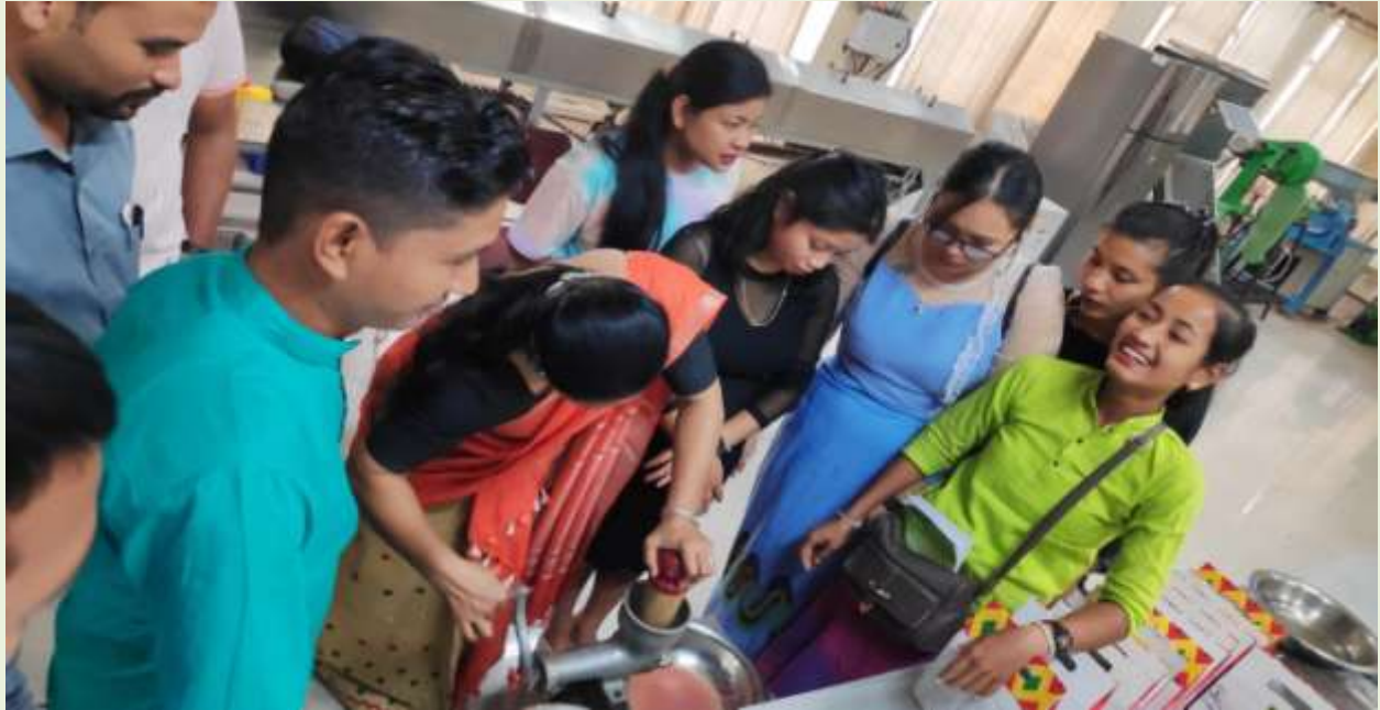
Demonstration of correct way to operate juicer cum pulper