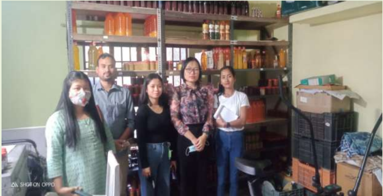
Storage room of Kamdhenu Industry