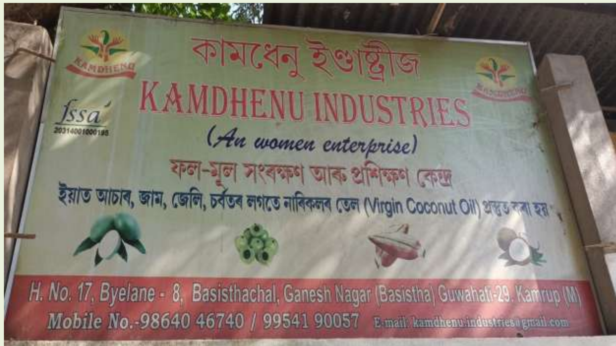
Exposure visit to Kamdhenu Industries at Basisthachal, Guwahati- 781029