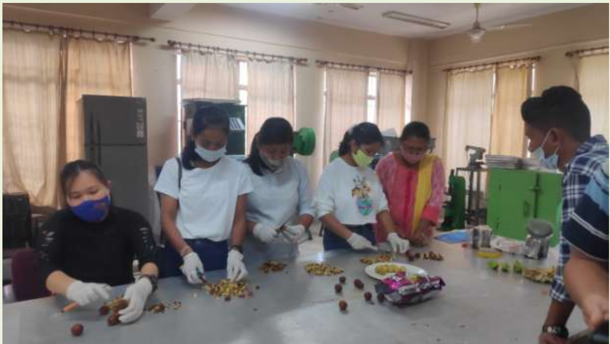
Cutting of Kiwi for Jam and Pickle preparation