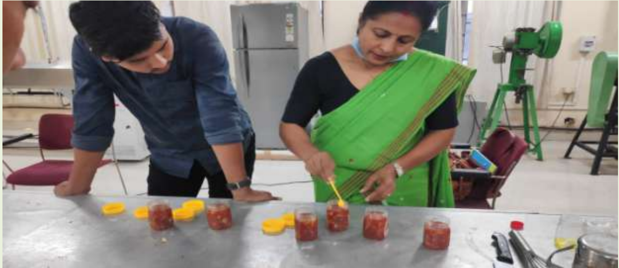
Demonstration of proper bottle filling technique