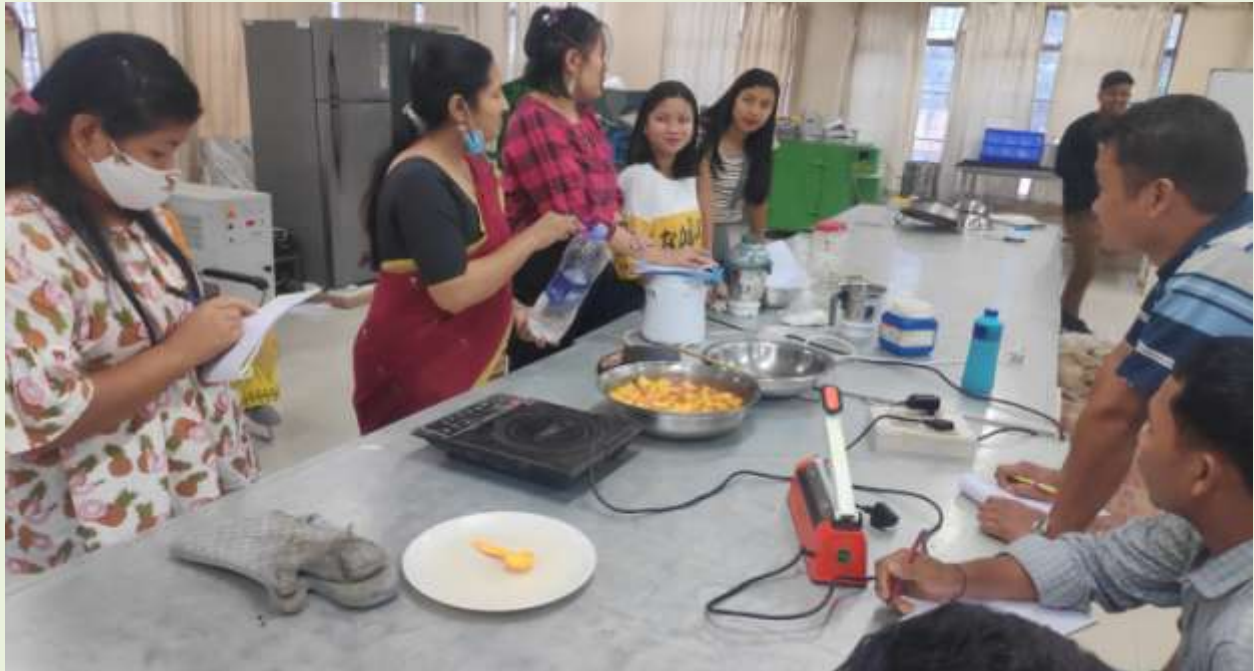
Preparation of raw Papaya for Jelly preparation