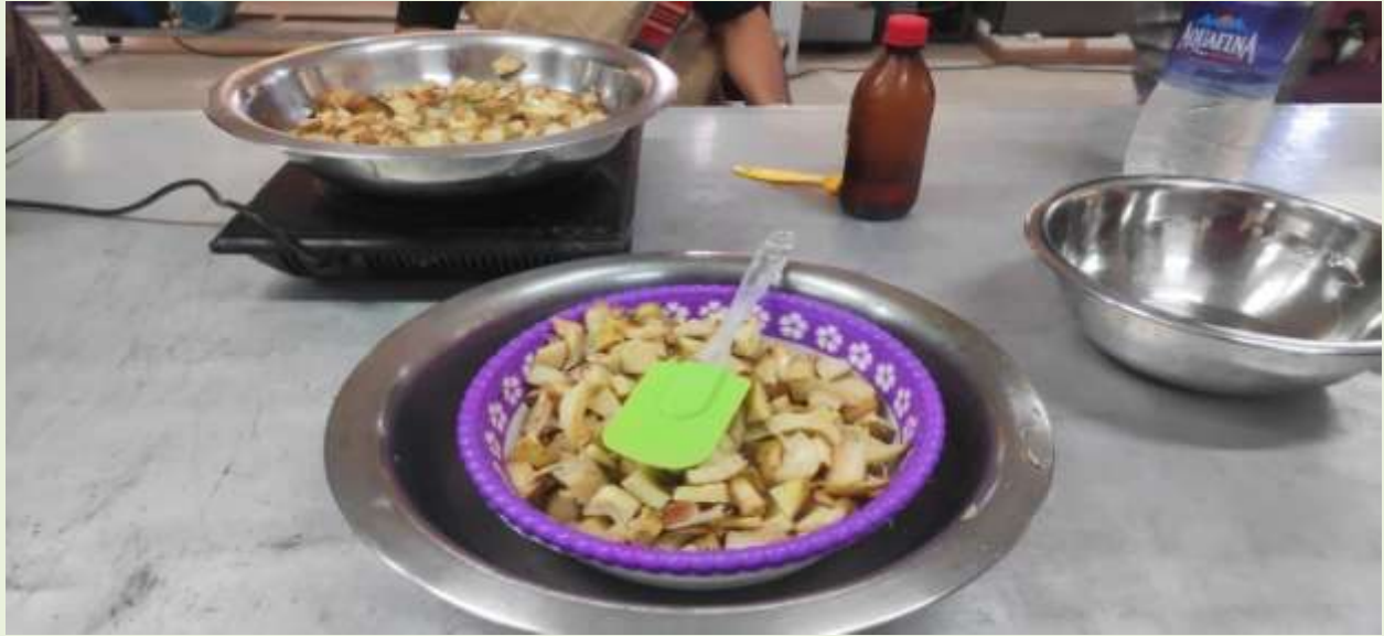
Chopped Dillenia Indica ready to be pickled