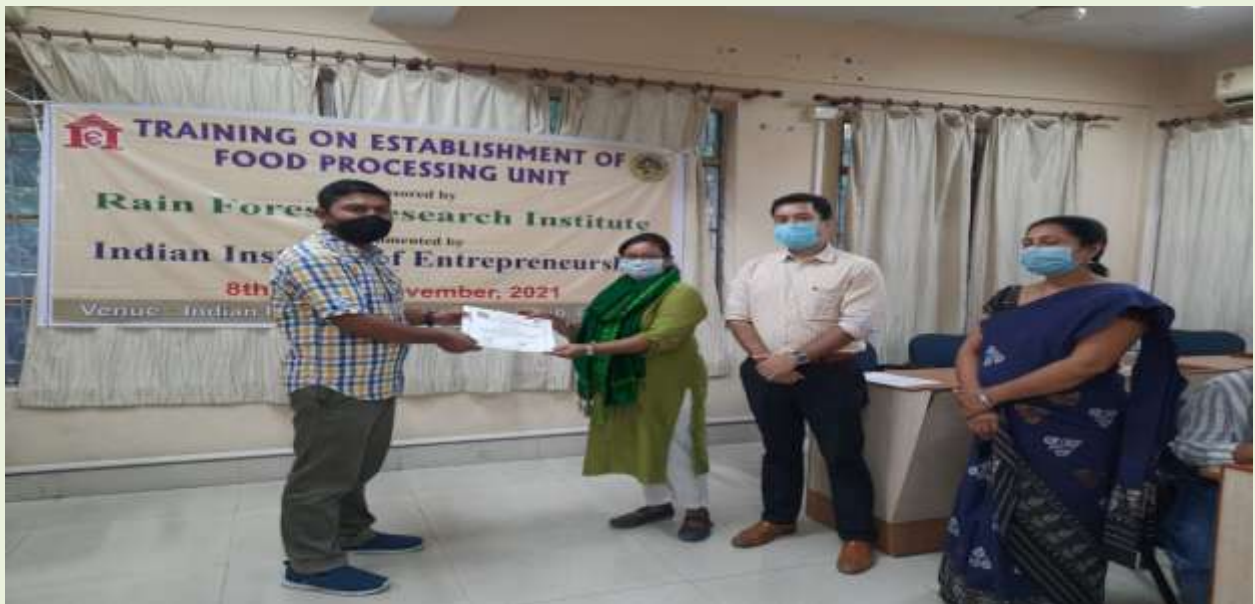
Certificate distribution programme