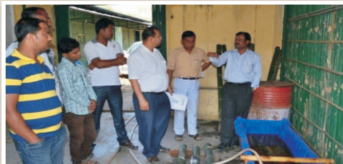
Demonstration of Bamboo Treatment Techniques by RFRI, Jorhat