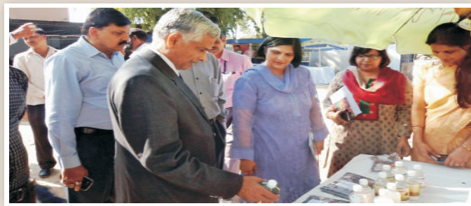
Training cum demonstration programme on Agro-forestry in U.P.