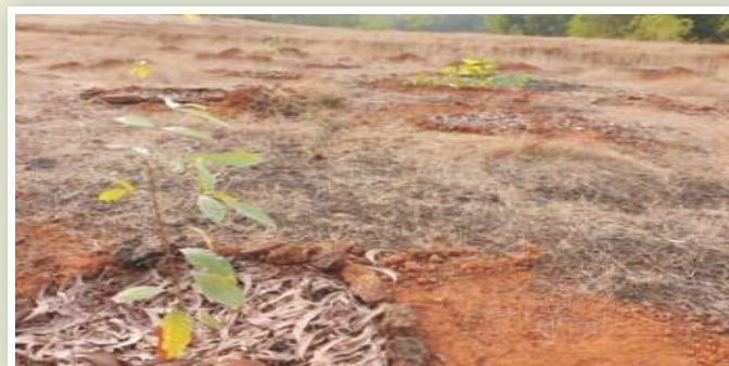
Planted S. macrophylla seedlings in laterite lands