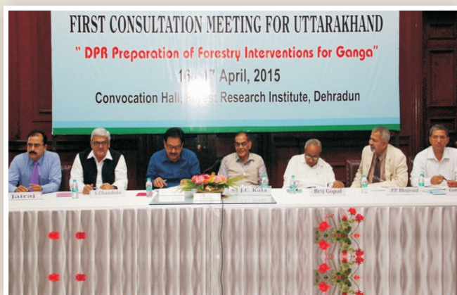
1 st Consultation Meeting for Uttarakhand of DPR Preparation of Forestry Interventions for Ganga

☞ The first Consultation Meeting for Bihar on "DPR Preparation of Forestry Interventions for Ganga" was held on 19 and 20 May 2015 at Aranya Bhawan, Patna (Bihar). Hon'ble Chief Minister of Bihar, Shri Nitish Kumar inaugurated the meeting which was attended by about 100 participants.