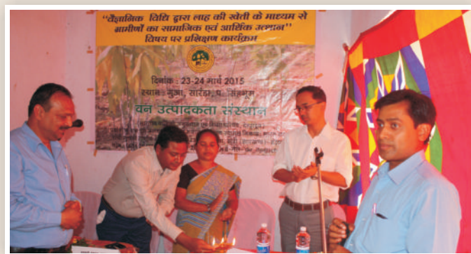
Training programme on "Socio-economic upliftment of Farmers through scientific Lac cultivation" at IFP, Ranchi

☞ Institute of Forest Biodiversity (IFB), Hyderabad organized training in Sustainable agroforestry models for Andhra Pradesh from 09 to 11 March 2015 at IFB Campus, Hyderabad.