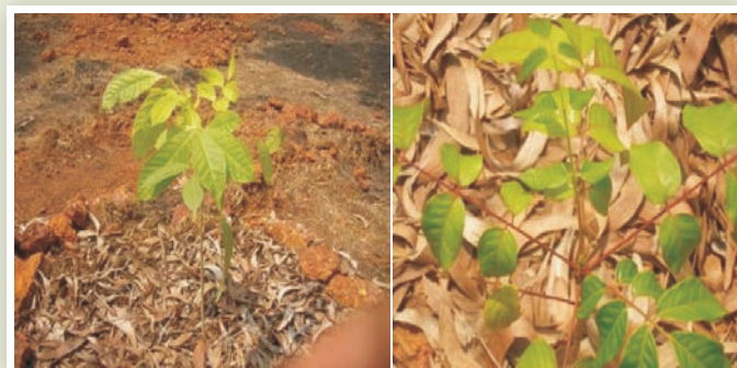
Fresh leaves in planted seedlings