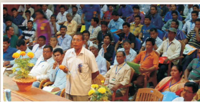
Interactive session with participants of “Tree Growers” Mela at RFRI, Jorhat

livelihood management and mitigation of climate change. More than 350 progressive farmers of North-Eastern states participated in the Mela. Apart from students from Universities, representatives from NGOs, SHGs, JFMCs, Government Departments, and financial institutions like NABARD took part in the Tree Growers' Mela, which was held for the first time in North-East India.