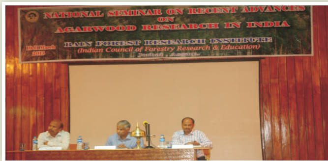
National seminar on 'Recent Advances on Agarwood Research in India' organised by RFRI, Jorhat

for entrepreneurship development for Bamboo Handicrafts, Bamboo Nursery and awareness generation for promotion of Bamboo Plantations on 30 June 2015.