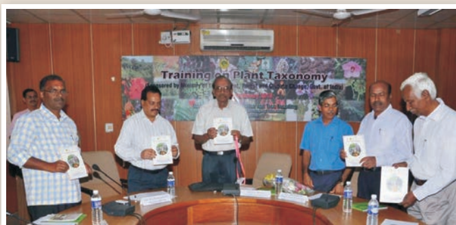
Training programme on ‘Plant Taxonomy’ in IFGTB, Coimbatore