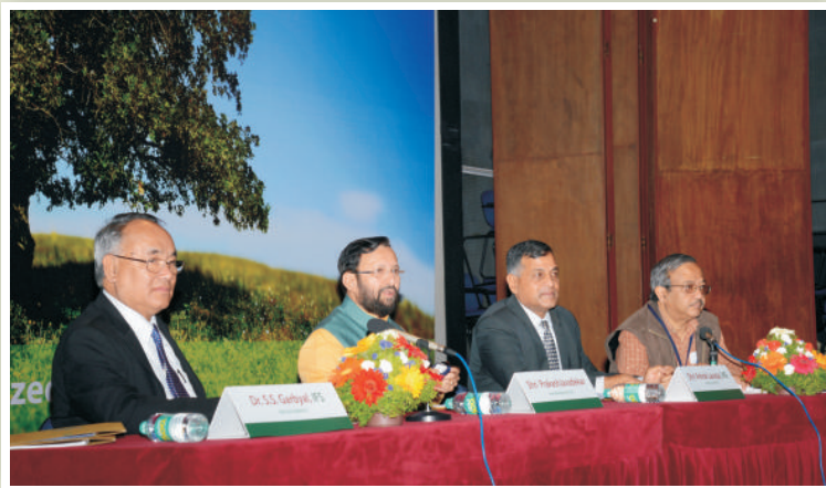
"Chintan Shivir" at Bengaluru

☞ Institute of Wood Science and Technology (IWST) , Bengaluru has organized two days " Chintan Shivir " at NIAS, Bengaluru on 08 and 09 February 2015. The participants were Forest Officers from the states of Southern India. This was a unique and innovative initiative enabling officers from Environment, Forest, Pollution Boards and Scientists from the concerned departments to participate in the Shivir to introspect and discuss the various aspects related to Ministry