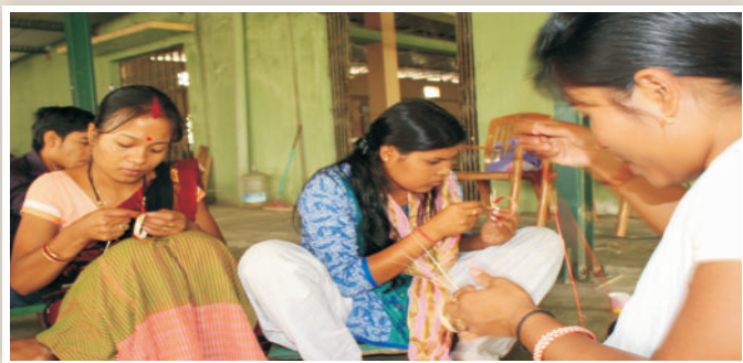
Training on Bamboos Ornaments at RFRI, Jorhat

Nagaon and Morigaon district of Assam under the Project "Capacity building, skill upgradation of artisans and promotion of traditional Bamboo handicraft and art with improved technology, suitable design and value addition".