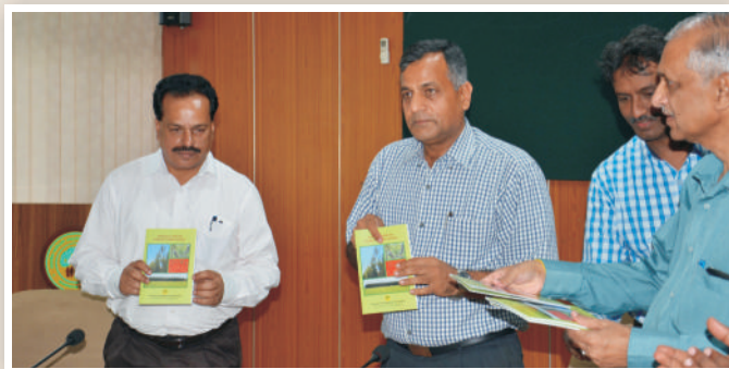
Secretary, MoEF&CC releasing a booklet on Casuarina at IFGTB, Coimbatore