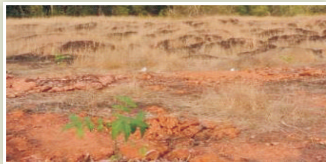
Planted A. triphysa seedlings in laterite lands